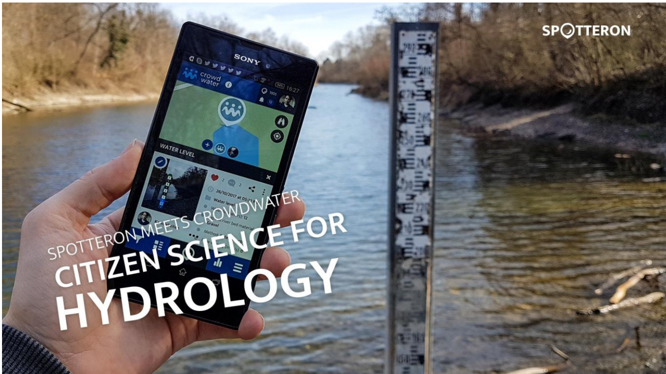
The CrowdWater app in action.